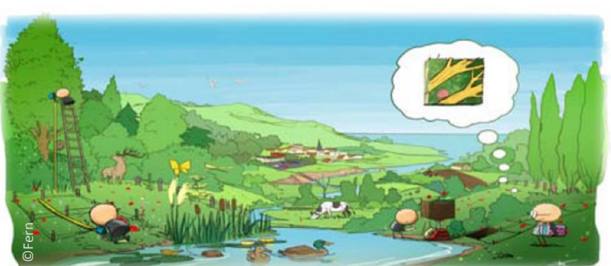
Indicators beyond monetary estimates

Difficult integration of ecosystem services in decision making and assessments